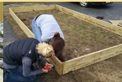
UWO nursing students constructing a garden at Father Carr's.