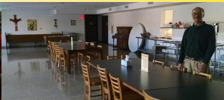
Our kitchen is sparkling clean thanks to the men living with us