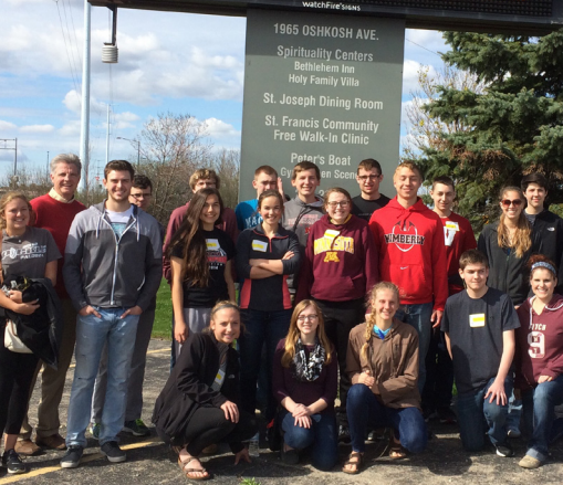
Holy Spirit Youth Group from Kimberly