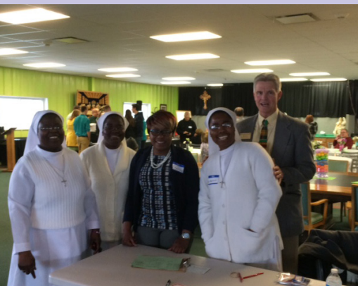
Easter was a great celebration