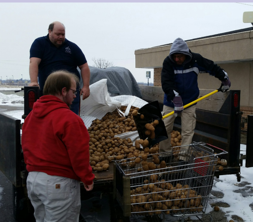
5000 pounds of potatoes is a lot