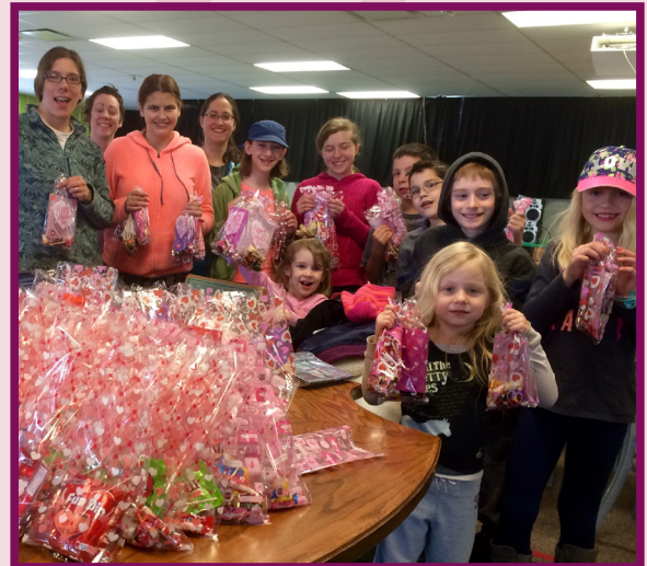
The Homeschool Hub Kids making valentine's gifts for those who come to the Friday food pantry. A beautiful and purposeful ministry.